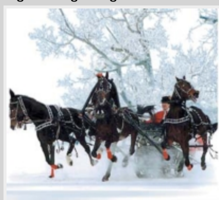
A troika, a Russian sled drawn by three horses