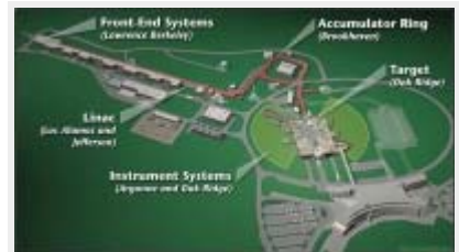
The SNS complex showing the technical contributions from different DOE laboratories