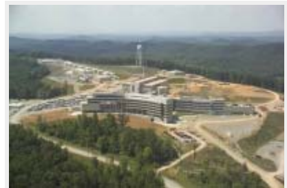
Aerial view of the Oak Ridge Spallation Neutron Source

This project is an example for us in several ways. First and most obvious, it represents a large investment by DOE in a research facility, so the success of this project, as well as their lessons learned are important for us to study. One very interesting aspect of this project is that it involved significant contributions and collaboration between multiple DOE laboratories (see graphic). Although this clearly complicates the management, it makes it possible to tap the different skills and strengths of the different laboratories brought together to construct the project. For the ILC, the US part of our effort also involves several DOE laboratories, as well as, of course, collaboration with laboratories around the world.