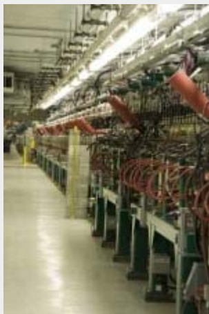
The SNS linear accelerator

The overall scheme for SNS involves creating negatively charged ions, injecting them into a linear accelerator, which accelerates them to very high energies. They are then sent through a foil that strips off their electrons, producing protons. The protons are accumulated into bunches in a ring and directed to the mercury target, where the neutron beams are created. This is the technically most relevant overlap between ILC and SNS: the linac of the SNS complex that accelerates the beam from 2.5 MeV to 1 GeV. The linac uses normal conducting and superconducting radio frequency cavities, plus some focusing and steering magnets. The third (highest energy) part of the linac accelerates from 200 MeV to 1 GeV and employs niobium superconducting cavities operating at 2 K.