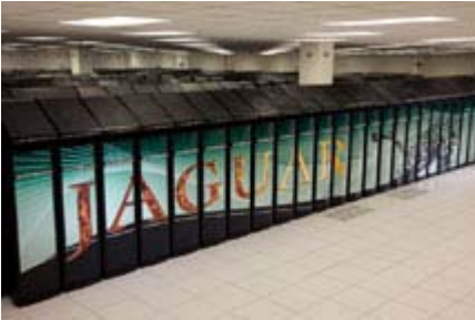
SLAC's team is using the Jaguar supercomputer to model wakefield effects.