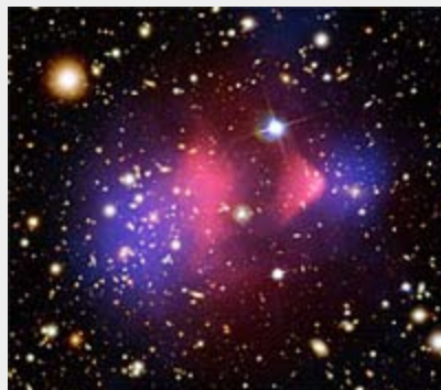
NewsLine readers want to read more physics stories.

For the third time, the NewsLine team conducted a survey this summer. Who are our readers? Are they satisfied with the content? The survey says that you read us more often, that you are generally satisfied with the balance of the subjects and that you are enthusiastic about NewsLine's new thematic issues. However you would like to see more science and expect more stories about the connections between the ILC and other particle physics or accelerator projects.