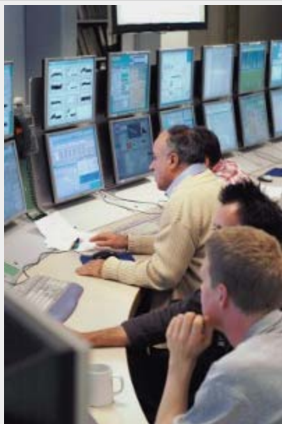
Concentrated faces in DESY's main control room.

Machine experts run DESY's FLASH accelerator under ILC parameters