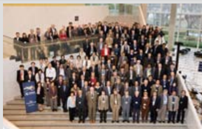
ASEPS participants gather on the steps of the EPOCHAL Center in Tsukuba.

A summit and the tip of the iceberg ASEPS summit in Tsukuba might change the research landscape