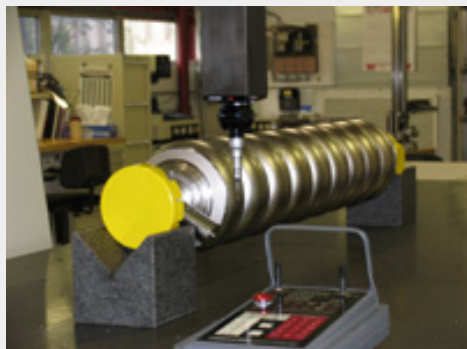
One of the four ILC cavities being measured at Fermilab before it is sent to Cornell University for chemical buffering.

Four unprocessed TESLA cavities recently arrived at Fermilab for measurements and testing. The 9-cell, 1.3 Ghz cavities, manufactured by ACCEL in Germany, will be used to construct the first U.S. cryomodule for International Linear Collider R&D near the end of 2006.