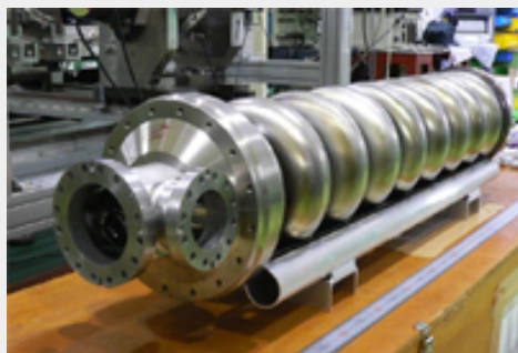
TESLA-like 9 cell cavity will soon be tested in a vertical cryostat for gradient performance.

The KEK laboratory in Japan possesses a long history of building and operating superconducting cavities, initiated in the TRISTAN days of the 1980's and with the low energy ring at KEKB, which was built in the 1990s. Most of these efforts, however, have been carried out in a context that was substantially separated from the R&D for linear colliders, because the focus of these efforts at KEK was on "warm" technology.