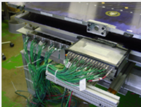
The first prototype plane with the 64-element multi-anode PMT (MAPMT) attached to it and the second prototype plane with no PMT attached to it. If you look closely you can see the green light from the 64 fibers coming out of the housing on the second prototype.

A group of universities in the United States are currently testing prototype detectors that could be used for a muon system in the International Linear Collider. With the help of some high school students from Quarknet, an educational program that brings students and teachers into the laboratories, the University of Notre Dame completed two of the eight large rectangular planes that make up the prototype detector this past summer. These planes are now undergoing tests and collecting cosmic ray data at Fermilab.