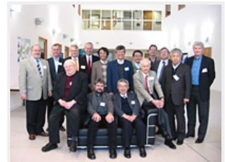
The Machine Advisory Committee.

The MAC meeting began bright and extremely early on Wednesday morning with the daily ritual of boarding the coach from the Holiday Inn to the Laboratory at 7:30 a.m. Fortunately the remaining days began at the slightly more civilised time of 8:00 a.m. The meeting was very intensive, particularly for the committee members, who had to digest an enormous amount of information and listen to a series of complex presentations. The presentations firstly concentrated on the