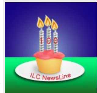
Big cheers for ILC NewsLine