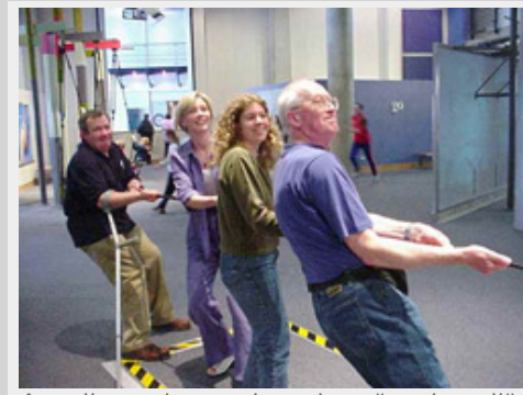
A well- engineered modern "push-pull" system will let two sophisticated ILC detectors share a single interaction point.

"The full realization of the scientific potential of the ILC argues for the construction and operation of two complementary detectors by two international collaborations." This statement comes from a chapter of the soon to be released ILC Detector Concept Report (DCR), and there are many arguments for having two detectors. They would maximise the scientific opportunities, give the opportunity to cross-check, and provide complementarity and reliability. The case is backed up by generations of successful historical examples in particle physics. Designing the ILC to accommodate two complementary detectors has been a fundamental precept of our design process. As we have optimised the ILC for cost-to-performance, we have made no changes that reduce the scope of the physics potential. In the beam delivery and detector areas, we have changed the crossing angle to