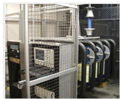
The prototype Marx modulator, designed and constructed at SLAC.

The current design for the International Linear Collider (ILC) requires 576, 10-megawatt klystron tubes to supply microwave power along its 40 km linear accelerator. Each ILC klystron tube needs 120,000 volt, 140-ampere pulses, fired at a rate of five pulses per second. Each pulse delivers a total energy of more than 23 kilojoulesthe kinetic energy of a 20 millimeter cannon shell.