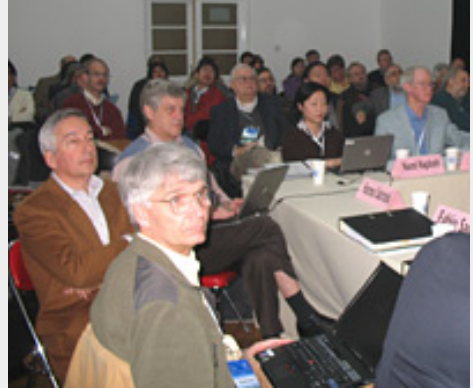
Members of the committee reviewing the ILC detector tracking systems.

International Review Panel Looks at ILC Detectors