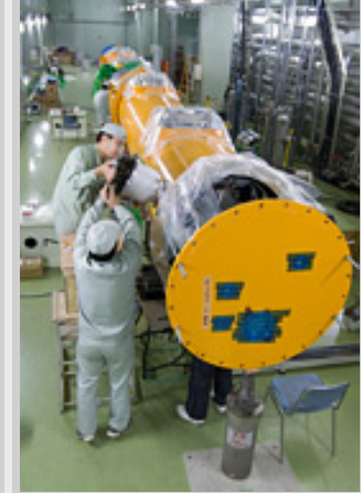
Crew installing the flange for signal cables on the cryostat (ICHIRO cavity part).