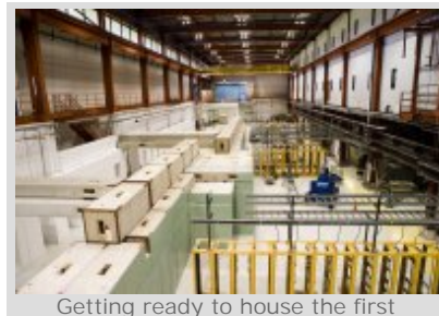
Getting ready to house the first crymodules: Fermilab's ILCTA.