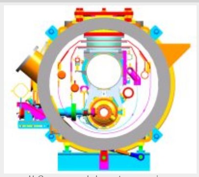
ILC cryomodule cutaway view

We are now making the transition from completing the International Linear Collider reference design to beginning the engineering design phase by holding a set of kick-off meetings to cover the major areas of the machine. The ILC project managers have organised this intensive set of meetings in order to interact closely with task leaders and team members who will be responsible for carrying out the actual design tasks. The meetings are covering a broad spectrum of issues that need to be understood before drawing up detailed work packages that will define our work toward the Engineering Design Report. The kickoff meetings cover issues that vary from organisational ones and technical topics to subjects that will have important consequences in the design work. A very good example of the difficult questions currently under discussion is to what extent we will require unified designs versus plug compatible designs for the cryomodules.