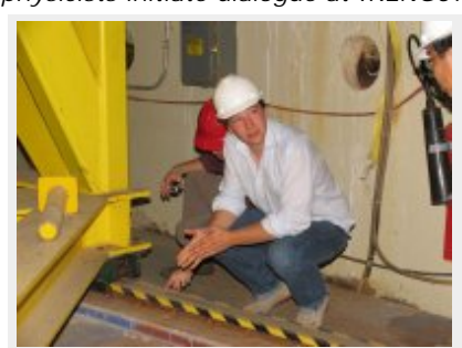
Older detectors can still teach us new tricks as the IRENG07 participants inspected the rollers of the SLD detector at SLAC.

Engineers, accelerator and detector physicists initiate dialogue at IRENG07