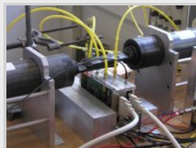
Two Dutch-built detectors measuring cosmic muon tracks in a lab at NIKHEF.