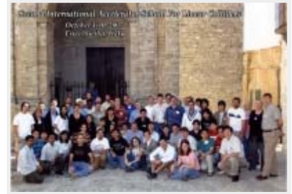
Participants in the 2007 Erice linear collider accelerator school.