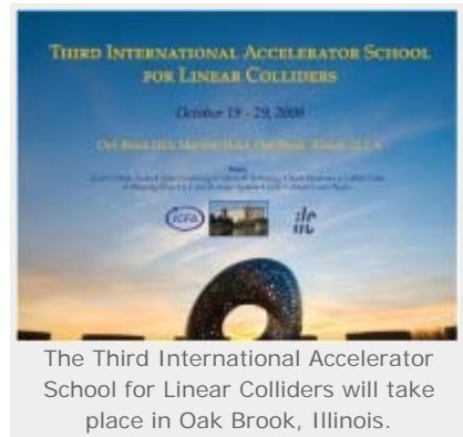
The Third International Accelerator School for Linear Colliders will take place in Oak Brook, Illinois.

For this year's school we expect a talented group of students from a similar applicant pool to the 2007 school. We will be adding lectures on muon colliders and room-temperature RF accelerator to the curriculum this year. We are particularly thankful to the DOE and Fermilab for providing support for this school during a time