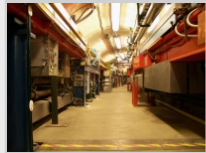
Cornell's CESR accelerator is becoming a test facility for ILC damping ring studies.