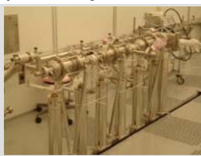
The assembled three-cavity string for the third-harmonic cryomodule.

Fermilab assembles third-harmonic cryomodule string