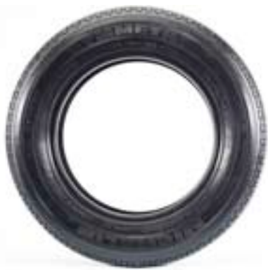
The auto industry uses particle accelerators to treat the material for radial tires, eliminating the use of solvents that pollute the environment.

"You know that you are going to get a low estimate because you're not going to capture everything, but this number will be credible," Jones says.