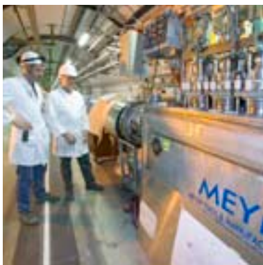
Meyer Tool & Manufacturing made key components for the cooling system in the Large Hadron Collider at CERN.