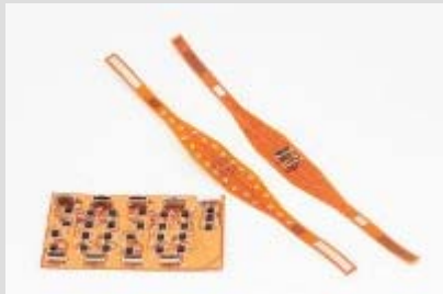
New thermal sensor components. Two sensing units on the right and a switching circuit on the left.