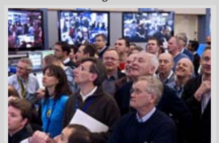
Waiting for collisions in the LHC...

With stable beams regularly circulating and colliding in the LHC, we have started the physics programme at 7 TeV. At a recent workshop in Italy, participants had the chance to take stock of what lies in store for the LHC's first physics run.