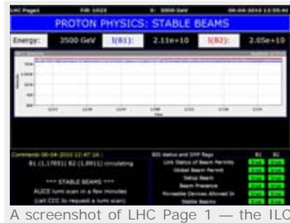
A screenshot of LHC Page 1 — the ILC version could look rather different.

What would a central machine operations web page for the ILC look like?