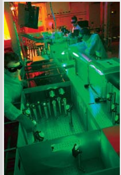
The laser used to accelerate electrons by plasma-wakefield acceleration to one billion electron volts in only three centimetres. (From Symmetry Magazine October 2009 –)

In my column last week on the 50 th anniversary of the demonstration of the first working laser at Hughes Research Laboratory in 1960, I stressed the remarkable impacts this fundamental physics discovery has had both in developing a multibillion-dollar industry and in affecting the way we live. Today, I continue that theme by projecting a little on what we can expect from further laser developments in the next fifty years. Of course, undoubtedly, some of the most important future developments have not even been thought of yet. Nevertheless, it is clear that the new laser developments will continue to have an impact on our lives in new and exciting ways, both by opening up new scientific opportunities and in creating new applications to our everyday lives.