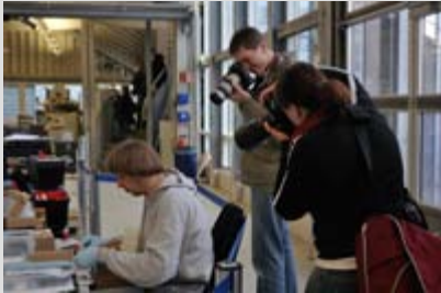
A scene from the first photo walk at DESY in 2009

From interactions.org: World's particle physics labs take amateur photographers behind the scenes