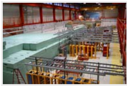
The New Muon Lab is being developed at Fermilab; it is where we plan important SCRF systems tests in the period beyond 2012

This brings up the question of what will be the next step for the ILC in the era beyond 2012, once the TDR and PIP are completed and reviewed.