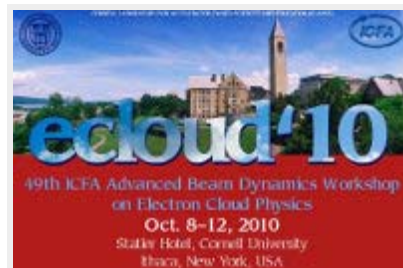
Cornell workshop on electron-cloud physics

Electron-cloud effects on particle accelerators have been known for some time, in particular the problems they create for intense positively charged beams. An electron cloud results from positive particles producing synchrotron radiation or colliding with residual electrons from ionised gas molecules in the vacuum pipe. Some of the resulting photons and electrons hit the walls of the chambers. This results in the emission of more electrons into the volume, creating the so-called electron cloud. For the ILC, the resulting cloud from one bunch of positive particles can affect and defocus bunches that follow, causing performance-limiting effects like emittance blow-up and other beam dynamics effects.