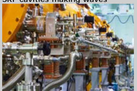
SRF cavities making waves